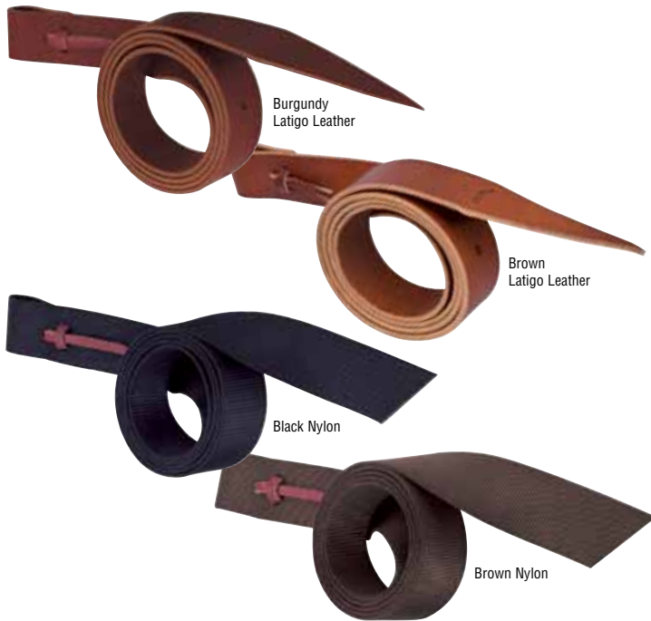
Burgundy Latigo Leather

Weaver Leather supply items are carefully selected to provide optimum quality and durability. As you are aware, however, horses are strong, powerful animals that can cause even the highest quality strap goods to break. Your common sense and commitment to equine safety are vital to the well-being of both you and your customer.