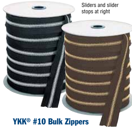
Sliders and slider stops at right