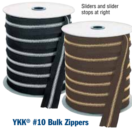
Sliders and slider stops at right