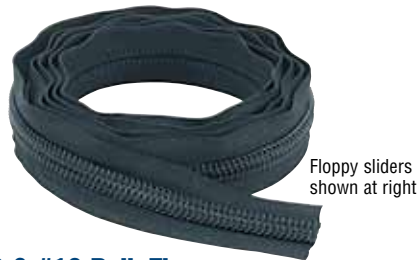
Floppy sliders shown at right