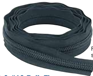
Floppy sliders shown at right