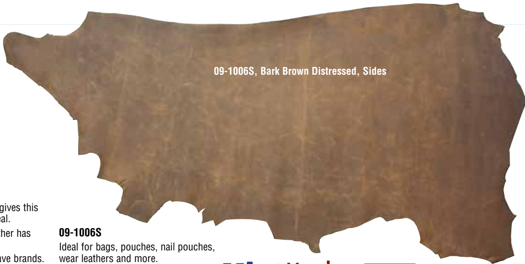
09-1006S, Bark Brown Distressed, Sides