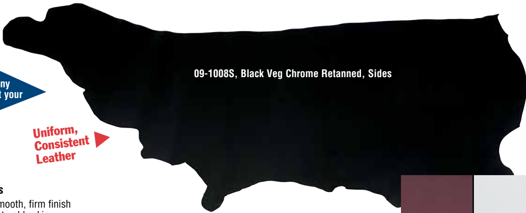
09-1008S, Black Veg Chrome Retanned, Sides