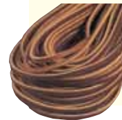
Deep chestnut with a yellow center