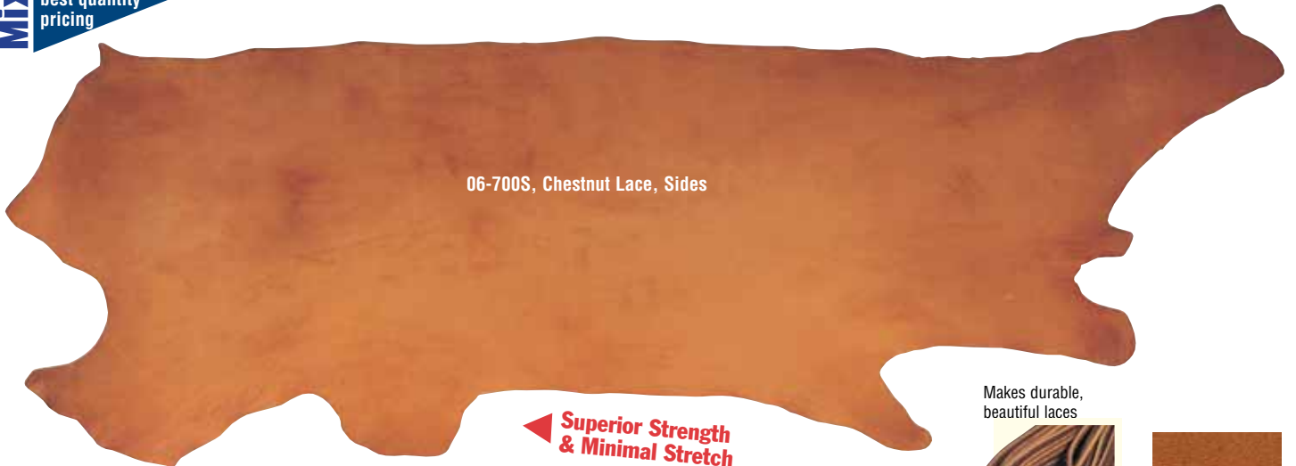
06-700S, Chestnut Lace, Sides

Mix & Match any combination of leather in any quantity to get your best quantity pricing