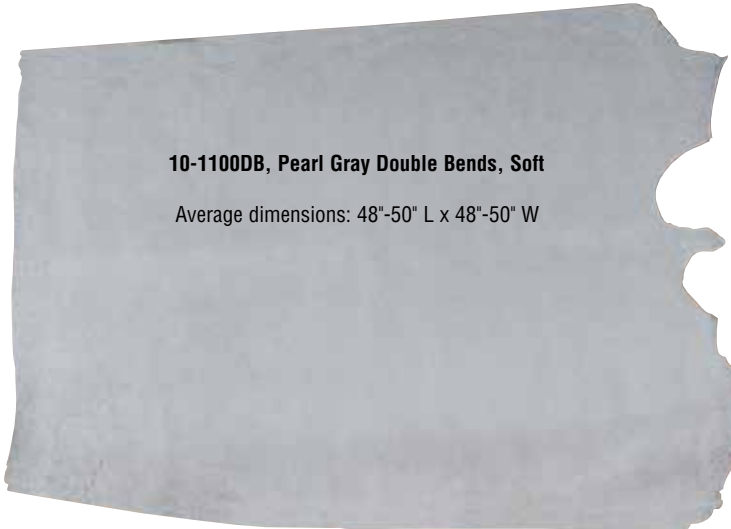
10-1100DB, Pearl Gray Double Bends, Soft

Average dimensions: 48"-50" L x 48"-50" W