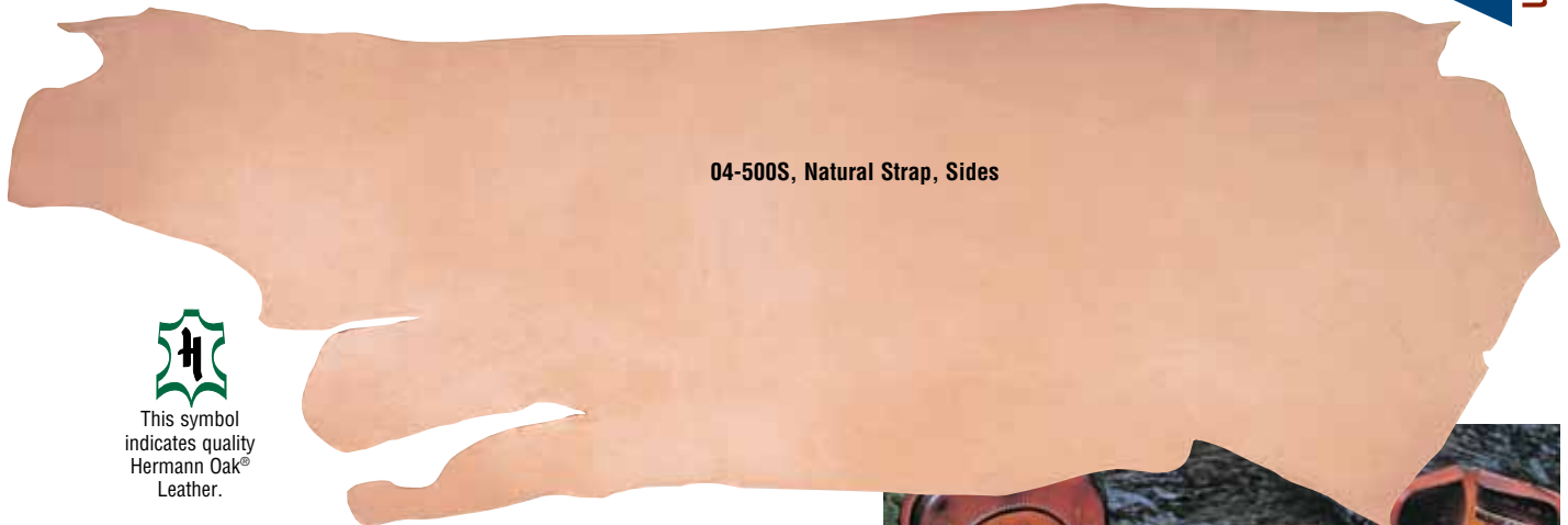
04-500S, Natural Strap, Sides