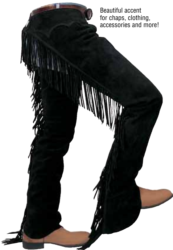
Beautiful accent for chaps, clothing, accessories and more!

See page 67 for our full selection of suede in 19 beautiful colors!